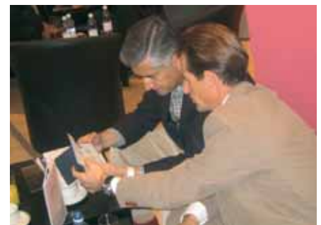
The Austria Card booth at CarteS is a focus point for many visitors. Various product demos and friendly staff are always ready for expert talks.

Paris, Tuesday, November 7 th , 2007, 9 a.m. The show can begin. The show is CarteS and, just like every year, Austria Card is in the midst of things and not just a bystander. Highlights are the PayPass demo and live card design.